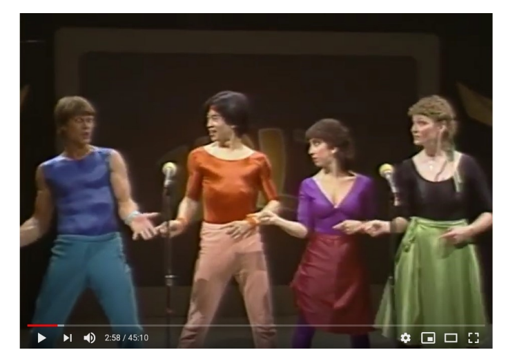
Not Too Young to Volt, November 12, 1983. <u>Item 3346</u>, Record Series 1204-05, SMA.

One of the most watched videos recently added to <u>SMA's YouTube channel</u> is Not Too Young to Volt , containing footage of a 1983 educational musical theatrical performance on energy conservation at Ballard High School.