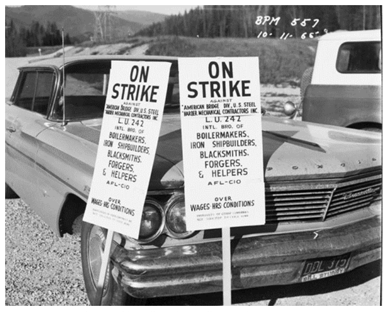
Signs used in Boilermakers strike, October 11, 1965. <u>Item 186928</u>, Record Series 1204-01, SMA.

In October 1965, construction work on the Boundary Dam project was halted by the West Coast Boilermakers' Union Local 104 strike. Picketing took place in Washington, Oregon and Northern California. The strike ended after 22 days when the eight-state contract dispute was settled.