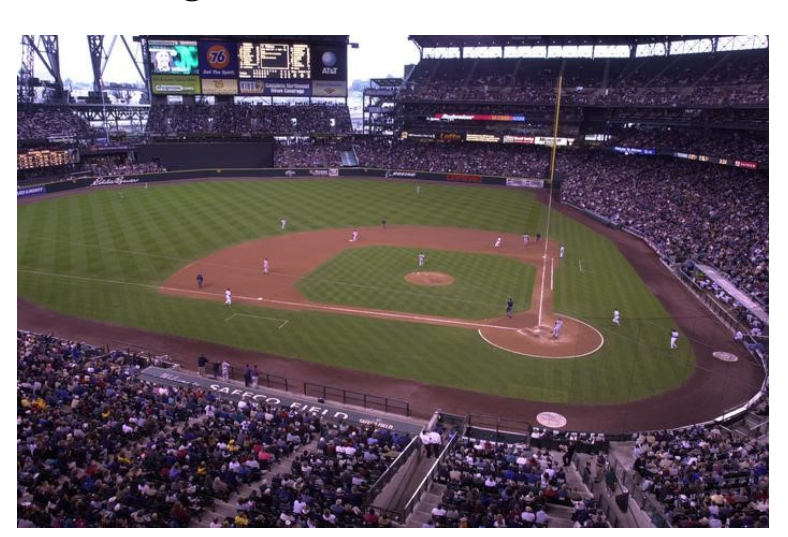
Seattle Mariners baseball game at Safeco Field on September 11, 2000. Item 105420, Record Series 0207-01, SMA.