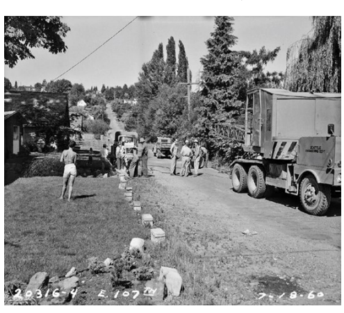
1107th St. & 30th Ave NE culvert removal, 1960. Image 65001, Record Series 2613-07, SMA.

A clickable map gets you to pages for each of the seven districts. Each district page has a section for early records which includes topics such as the aftermath of the Great Fire, annexations, the