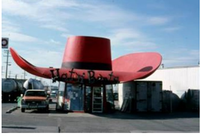
Hat and Boots Service Station, circa 1980. Item 193638, Series 1629-01, SMA.

SMA staff created a new set of webpages featuring resources in the archives by Council District. While not an exhaustive list of what is in the archives for each district, the pages provide a sampling of records meant to engage constituents with the history of their neighborhood. The pages are structured around the themes of Parks and Recreation, Infrastructure and Public Works, Neighborhood Development and Community Services, and Legislative History.