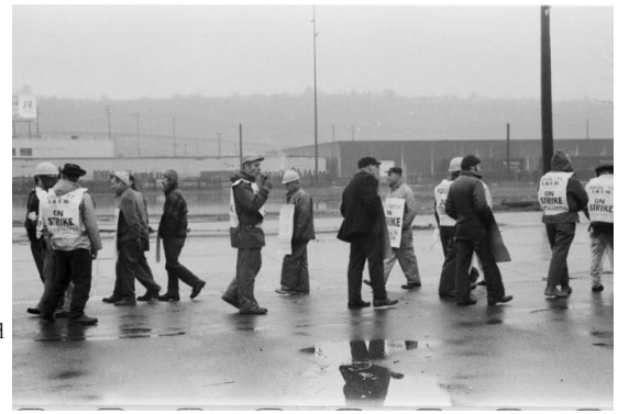
Picket lines at South Service Center, December 15, 1975. Item 192890, Record Series 1204-01, SMA.