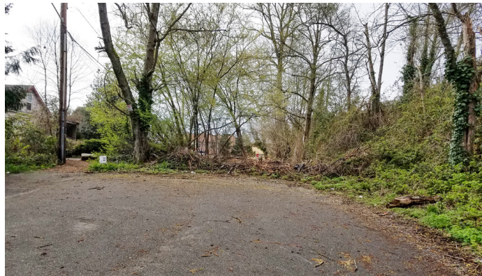
Existing unimproved walkway on 26th Ave SW at SW Trenton St

In 2016, the Chief Sealth High School Walkway project was one of 12 selected by the Levy to Move Seattle Oversight Committee to be funded through the SDOT's Neighborhood Street Fund (NSF) program. The NSF program funds projects requested by the community.